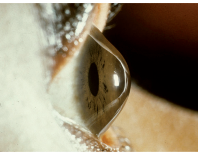
The Medical Photographic Imaging Centre, Royal Victorian Eye and Ear Hospital

It is sometimes associated with other conditions such as allergies, infantile eczema, asthma, reduced night vision, double jointedness and, in rare instances, with occasional short bouts of chest pain.